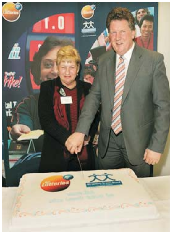
Photo - The cutting of the cake at the launch.

For more information about this fund keep checking FundView.